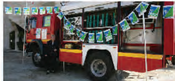
Forest Fire Truck Given by Hadassah