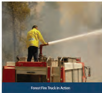
Forest Fire Truck in Action

Urgent Update! Latest count over 1,000,000 trees have gone up in smoke. Please help us replant!