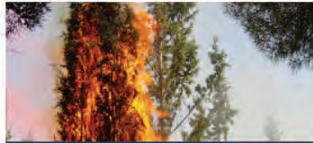
Forest Fires Raged Across Israel