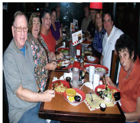
Singles Group at TGI Fridays