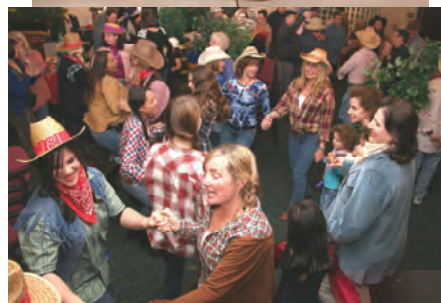
Purim 2010 Cowgirls dancing