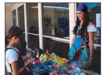
Above: BJCS parent helps a student make a selection at the Purim Carnival in March.