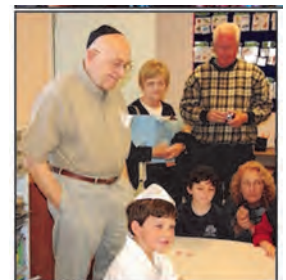
Grand-parents visit our kindergarten/first grade classroom.