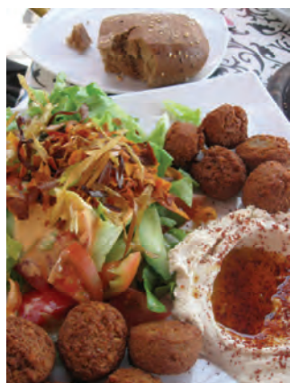
falafel in Safed