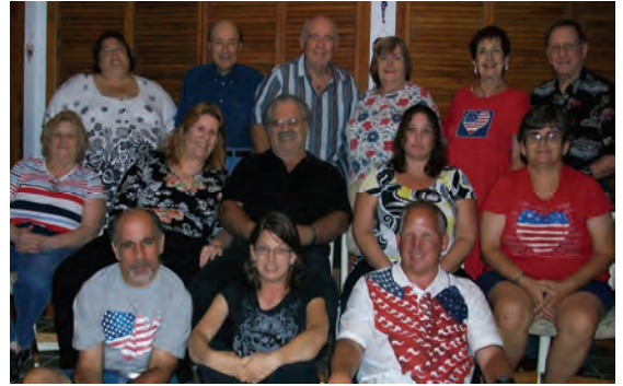
July 4th Party

If you are a Jewish woman or Jewish man ages 40-100 then we want you!!!