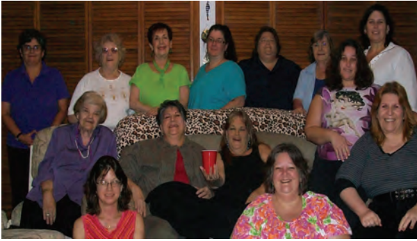
Girls Night Out party