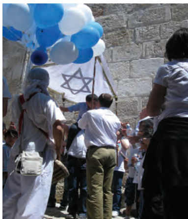
Bar Mitzvah in Jerusalem