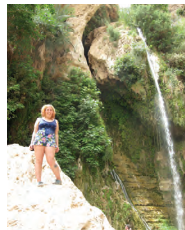
ein gedi oasis