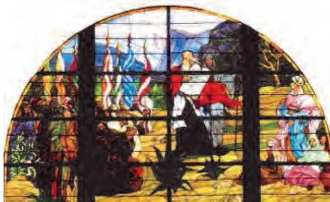
The Grand Window – Interior View

In closing, I would like to thank you all for your continued support of Federation in 2011. We look forward to another productive year!