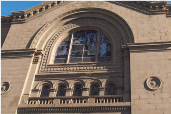
The Grand Window – Exterior View