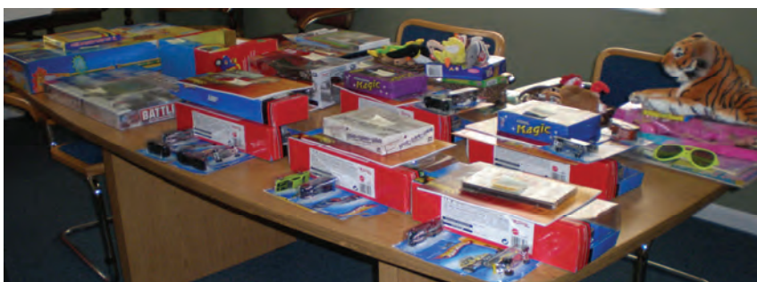
Organizing the gifts for the children.