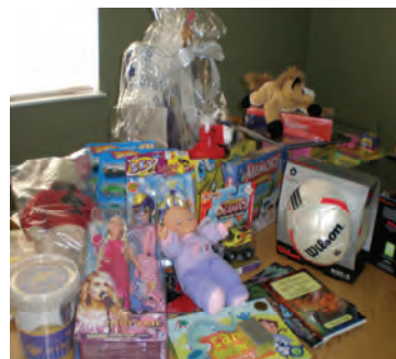
Some of the donated gifts