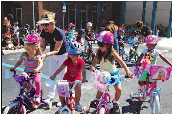
Left: BJCS students ride in a Bike-a-thon to raise money for the Japanese Relief Fund. Over $900 was raised and sent to the Jewish Federation of North America to be used for the earth-quake and tsunami victims.