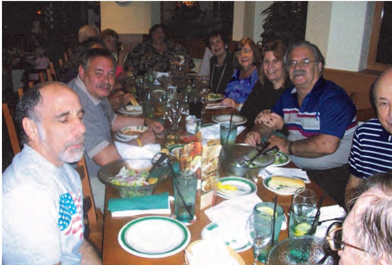
Some of the Jewish Singles Social Club members dining at the Olive Garden....