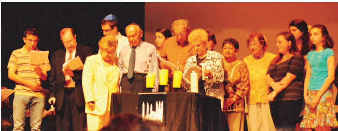
Survivors and escorts gather at the conclusion of the Candle Lighting ceremony.