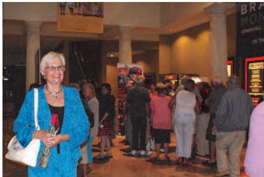
Federation Movie Night at The Oaks Theatre – The Debt starring Helen Mirren

Federation movie night was a tremendous success. About 100 Federation members and their guests attended a screening of "The Debt," starring Helen Mirren and Tom Wilkinson. Without giving away the plotline for those of you who didn't see the film, it is remake of an Israeli film with plenty of twists and turns, all centered on an event that took place thirty years before. The film has earned very positive reviews, and The Oaks Theatre and management were quite easy and gracious to work with. Everybody was pleased with the turnout, which I believe is really a testament to the support people feel for the Federation. We are certainly planning on making movie night a regular part of the Federation calendar.